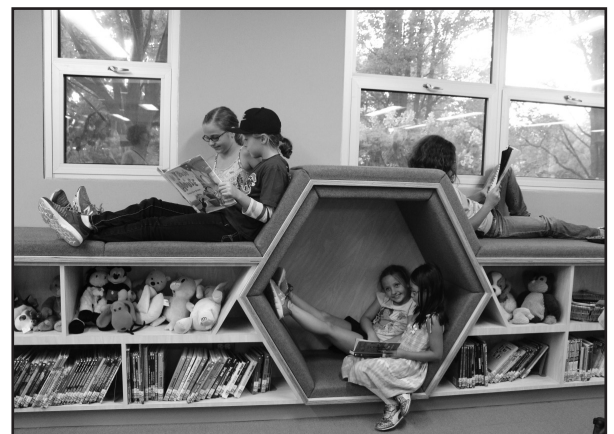
Students can find the perfect spot to read in Romona's new Learning Commons.