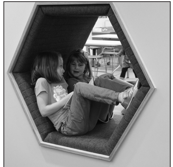
These two check out one of the great spaces at in the new McKenzie Learning Commons.